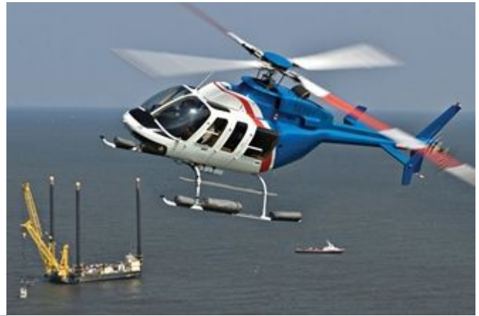
STC'd Installation Kit for Bell 407's Model # T6-200-01-B